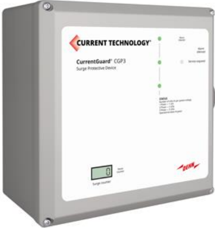
Now part of DEHN: The Current Guard Plus 3.