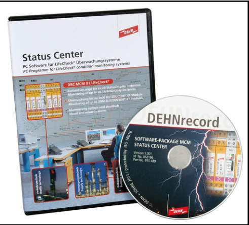
DRC MCM XT Status Center software for displaying up to 20 Status Display instances